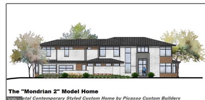
The "Mondrian 2" Model Home A Modern Contemporary Styled Custom Home by Picasso Custom Builders